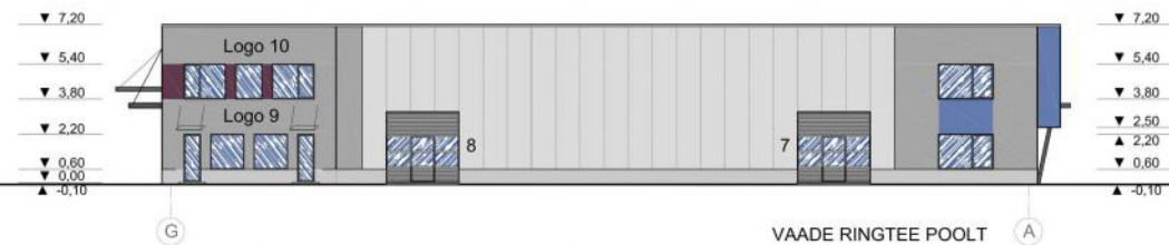
VAADE RINGTEE POOLT