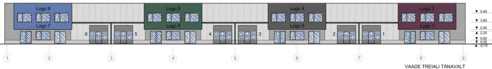
VAADE TREIALI TÄNAVALT